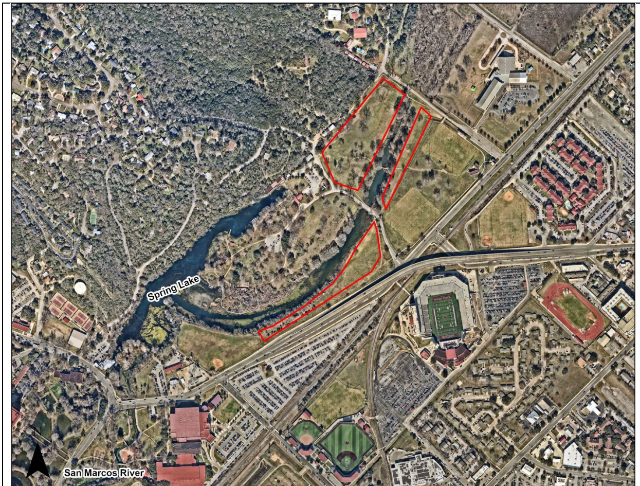
Figure 2. The red polygons denote areas around Spring Lake slough arm and lower Sink Creek identified for riparian restoration and riparian buffer expansion.