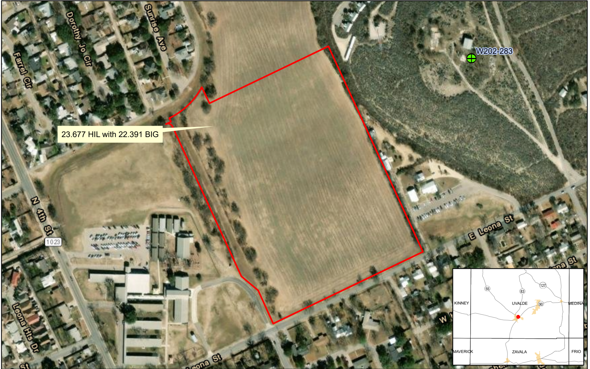
Exhibit A: P102-100 (UV00605) LEC Legacy, Ltd.