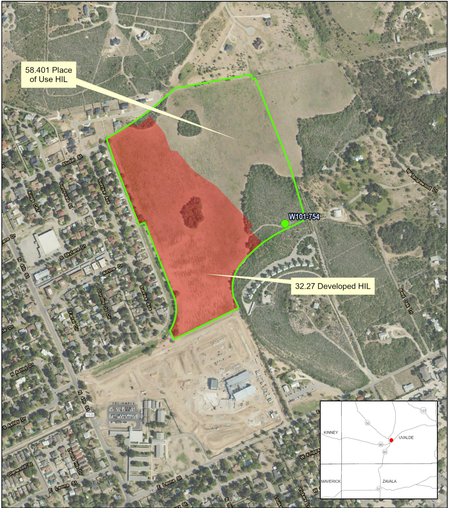
Exhibit A: P102-100 (UV00605) LEC Legacy, Ltd.

Document Path: C:\Users\season\Documents\2026_ArcGISPro_354\BasesConv\PA\P102_100\P102_100_2026.aprx Date: 3/16/2026