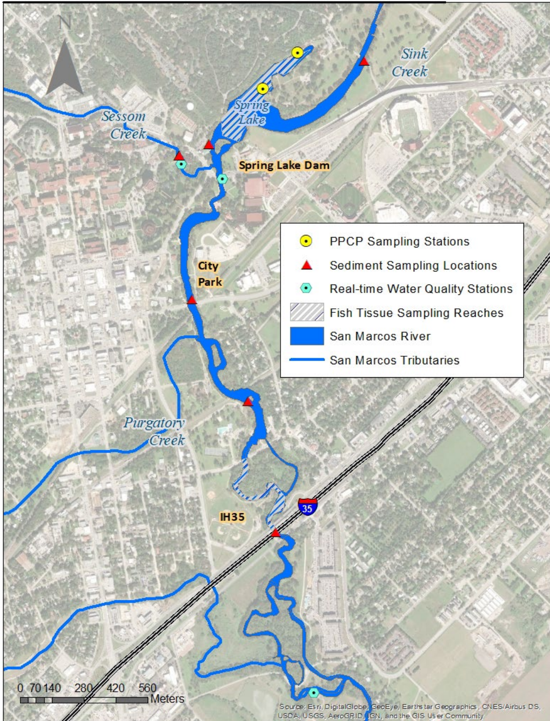
Figure 2. Water quality sampling locations for the San Marcos system.