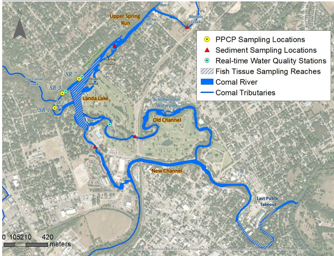
Figure 1. Water quality sampling locations for the Comal system.