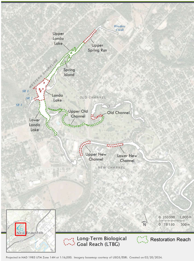
Figure 1. Comal Springs System Long-term Biological Goal/Restoration Reaches